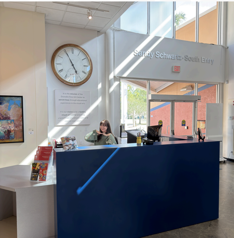
VISITOR SERVICES DESK

This is the Gallery Shop at the Dunedin Fine Art Center, where I can look at and buy handmade items created by local artists.