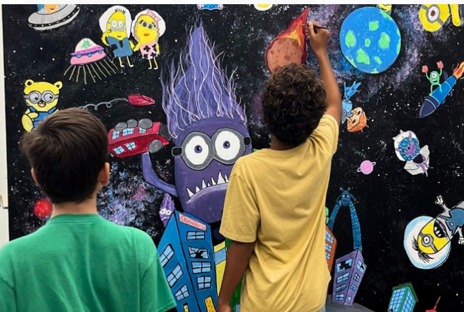
KIDS SUMMER CAMP - MURAL MADNESS

Scan QR code to see our offerings for kids!