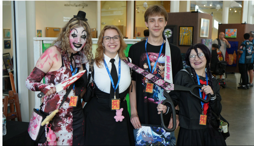
DFAC CON 2025

There is always something new to see and do at DFAC!