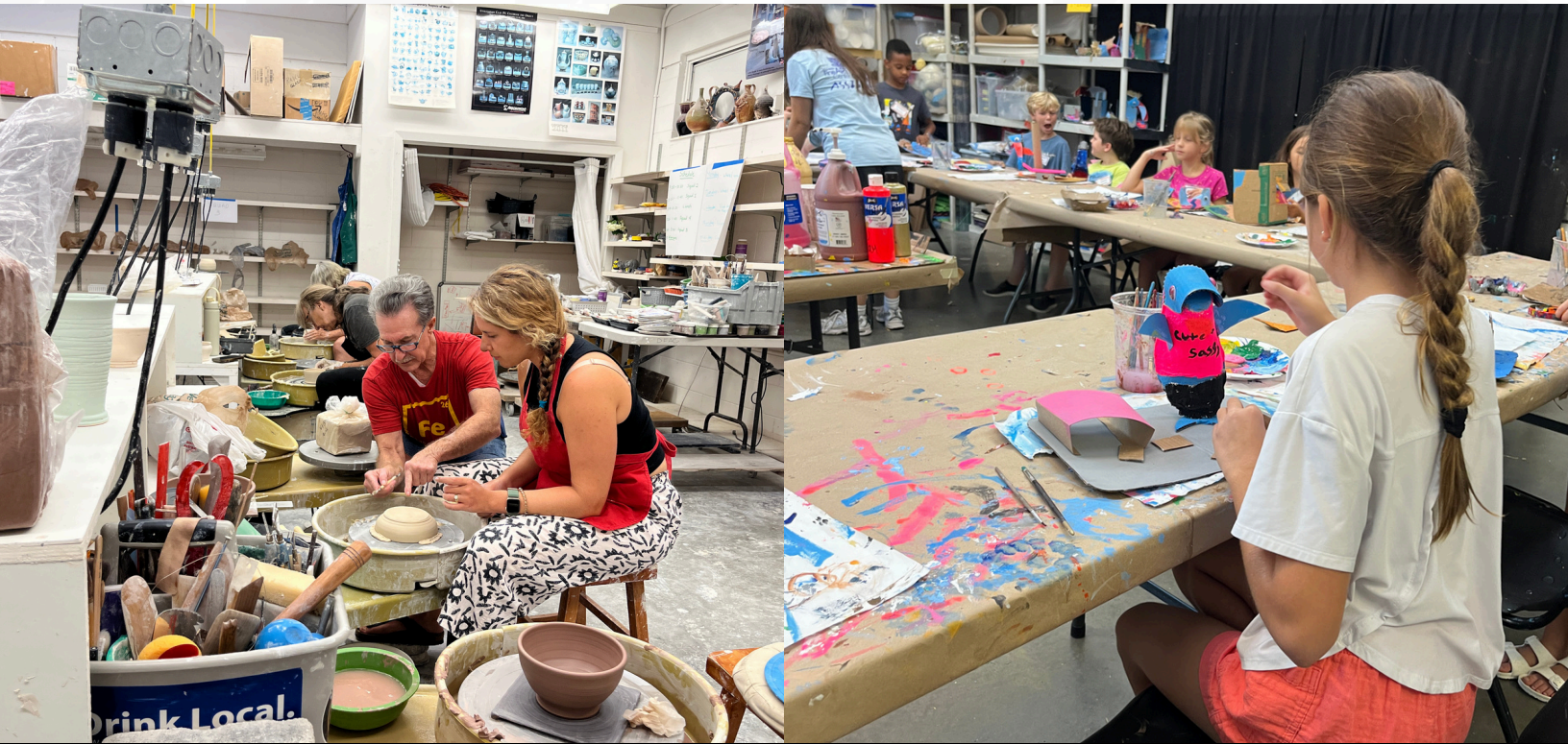
ADULT CERAMICS CLASS

Scan QR code for more class information.