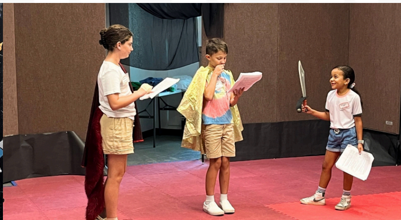
KIDS SUMMER CAMP - ARTS IN MOTION