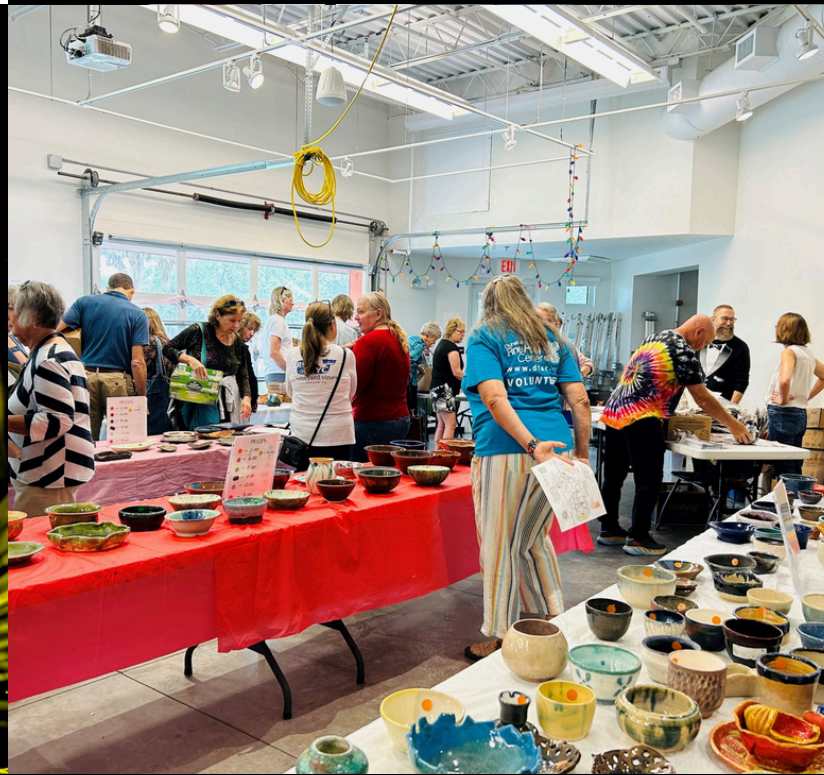
OPEN HOUSE & CLAY SALE