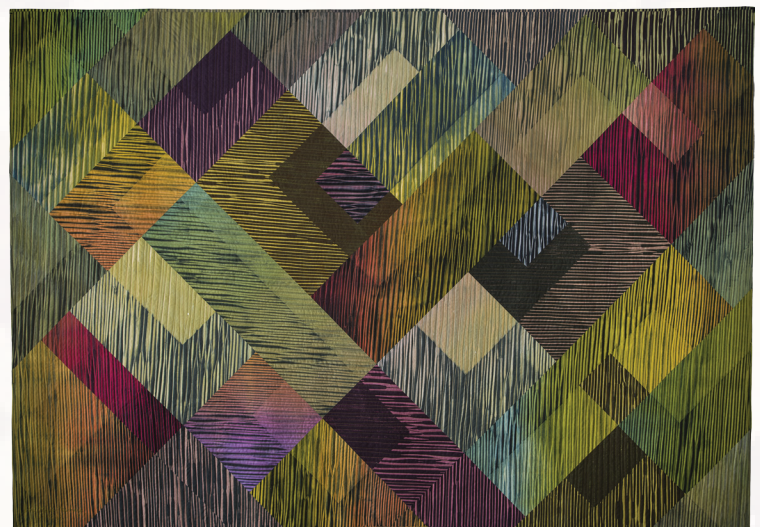
Jan Myers-Newbury - Quilt National

admission $10 - seniors $8 - students w/ID $5 12 and under & DFAC members FREE