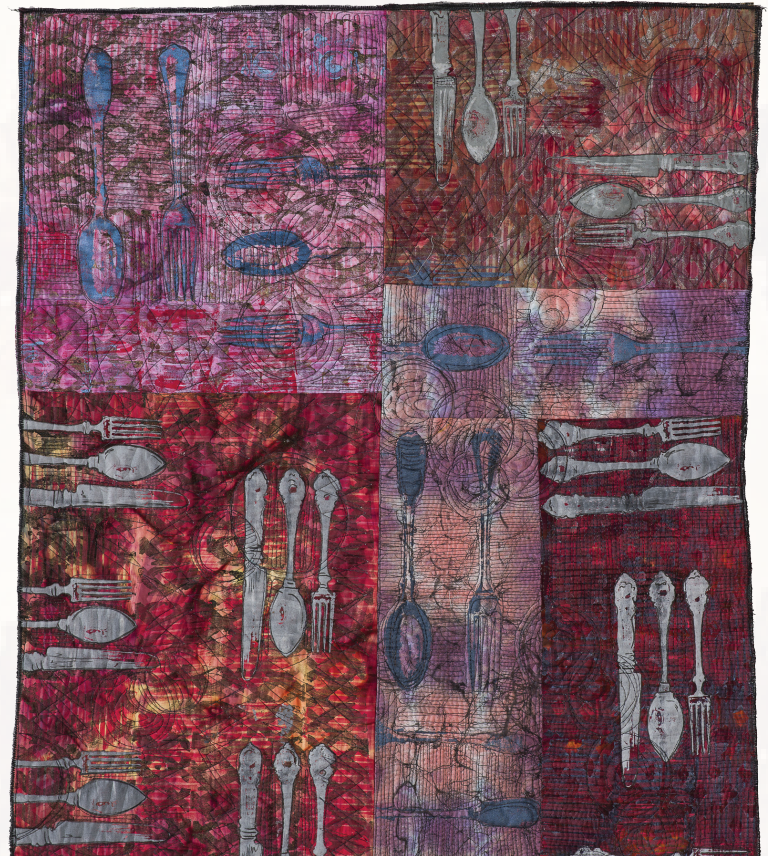
Susan Callahan - Quilt National

Mon - Sat 10 am - 5 pm (cafe' until 2 pm) Sunday 1 - 4 pm (cafe Closed Sunday)